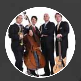
THE FOUR FRESHMEN July 19-22