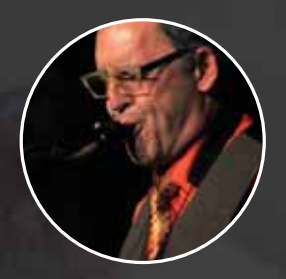
DETROIT JAZZ FEST ALL-STARS August 9-12